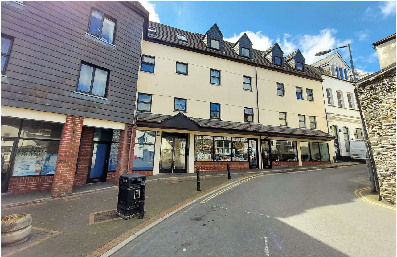
Society on the right hand side. The entrance to Market Court will be identified a short distance down on the right hand side.